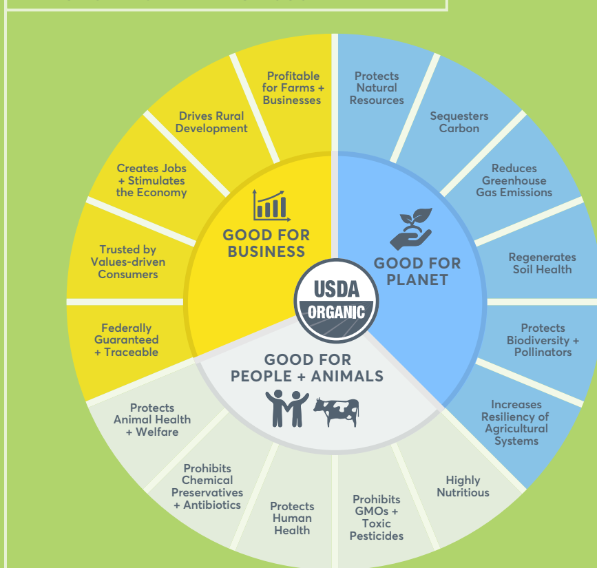
THE ORGANIC WHEEL OF SUSTAINABILITY

Over 82% of US households stock organic food in their kitchens.